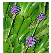
△ Aechmea gamosepala

Mosquito control decisions should be based upon a monitoring program that includes habitat inspections and a rigorous sanitation program.