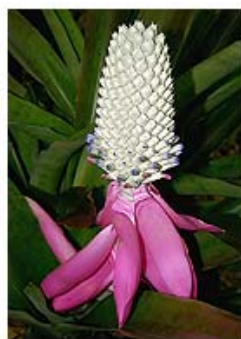
△ Aechmea mariae-reginae : A bromeliad at PJI that has phytotelmata that can breed mosquitoes.

An IPM program may take advantage of various pest management options, including source reduction, mosquito habitat modification, and the use of biochemical pesticide products to control larval and/or adult mosquitoes.