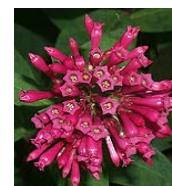
△ Cestrum elegans